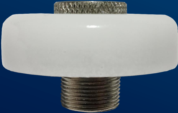
UNIVERSAL MICROPHONE TALLY SYSTEM